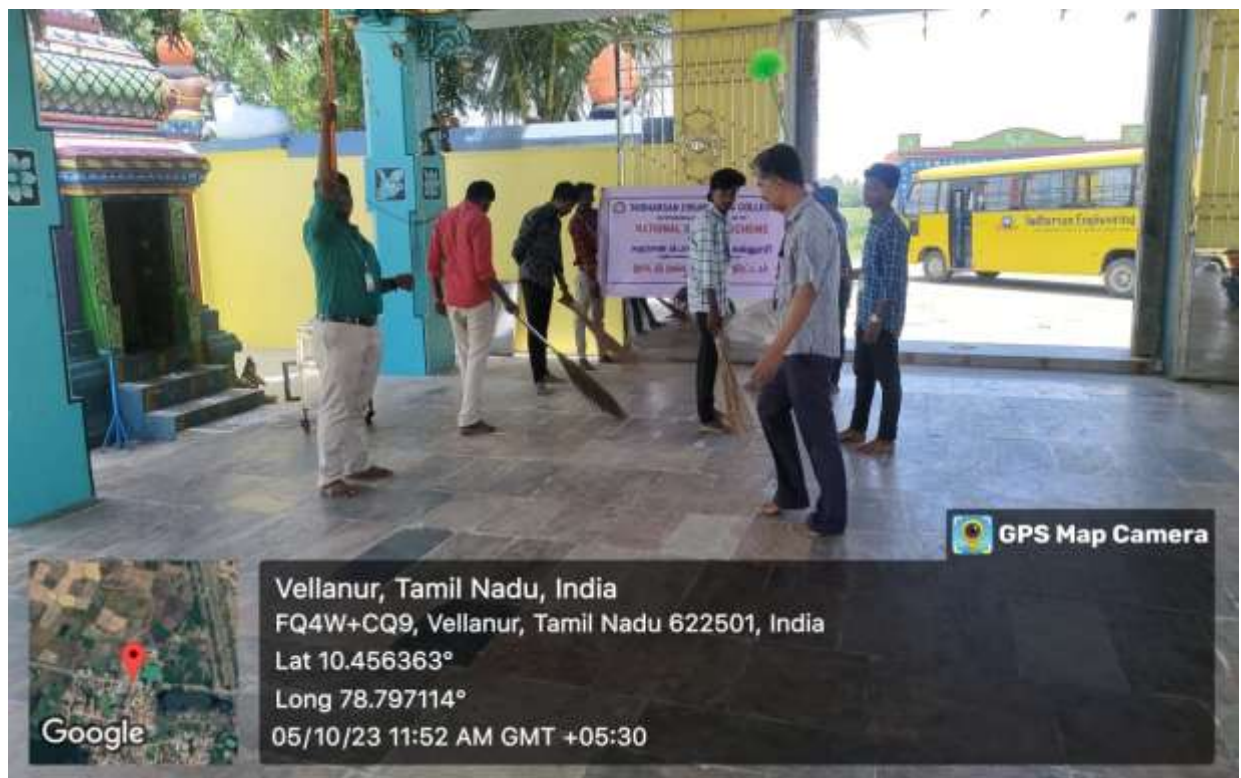
“Temple Premises Cleaning” activity at Alagu Natchiamman Temple, Vellanur