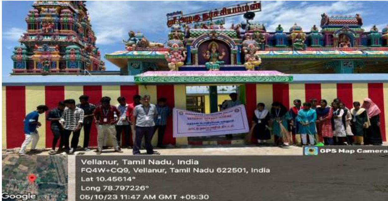
Our NSS volunteers actively participated in “Temple Premises Cleaning” activity at Alagu Natchiamman Temple, Vellanur